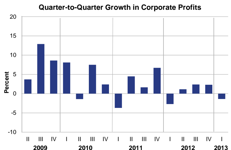
Corporate profits growth is measured as the percent change from the previous quarter.

Profits of nonfinancial corporations fell 0.5 percent at a quarterly rate in the first quarter, and profits of financial corporations fell 0.8 percent. Profits from the rest of the world fell 4.3 percent.